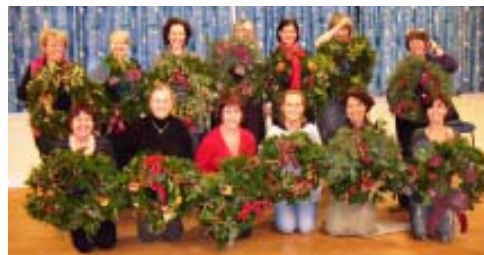
The photo shows the group happily posing with their festive creations (or resting on their laurels!) Great fun.

Claudia had cut a wide variety of greenery from the Garden, and for three hours in the Kirk Hall the thirteen students tied and snipped and decorated, barely stopping for tea and the tempting home baking provided. By 5 o'clock there were thirteen magnificent wreaths, each one distinctive and personal to its maker.